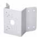
PFA151 Corner Mount